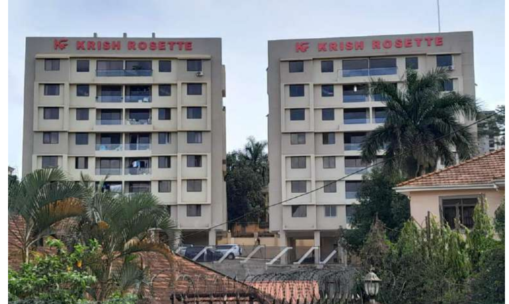
KRISH ROSETTE BLOCK B - NAGURU (Completed)

Indulge in the sophistication of our spacious apartments with breathtaking views of Naguru, capturing your heart at first sight. Prominently positioned on Gasper Oda Street in Lower Naguru, these residences offer a promising location that enhances your living experience.