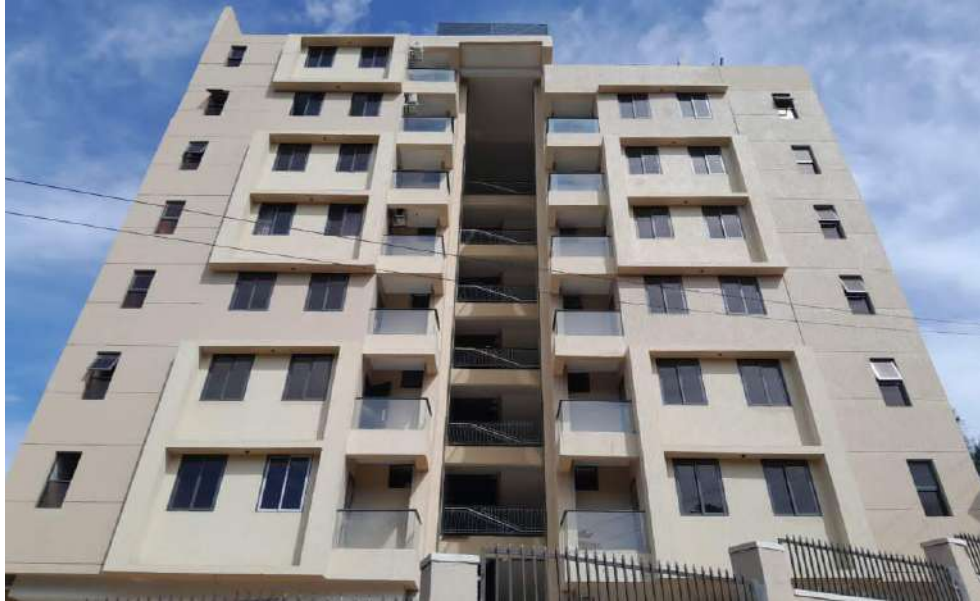
KRISH ROSETTE BLOCK A - NAGURU (Completed)