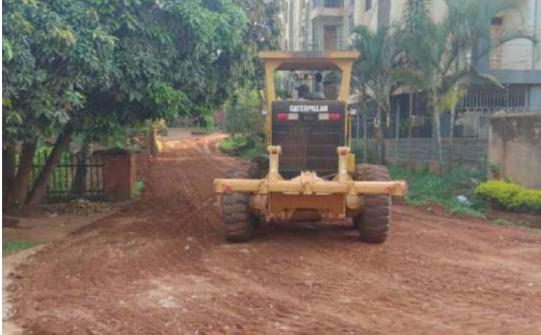
Kimera Close Road

Krish Group's construction projects have been accompanied by a dedicated focus on infrastructure development. As a result, Krish Group has successfully created well-built roads in the surrounding areas. These roads not only improve the accessibility of our premises for tenants but also eliminate any inconvenience caused by potholes, ensuring a smooth travel experience and area value addition.