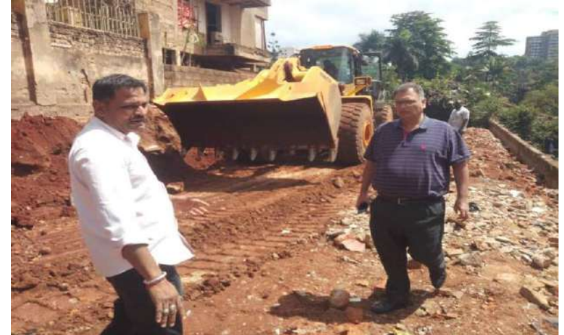
Gasper Oda Street